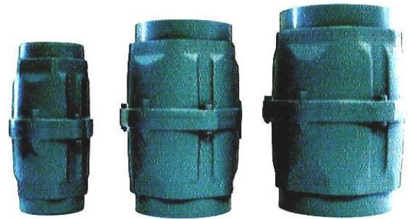
VRL6 VRL6 HP

Maximum efficiency is achieved by keeping operating values (flow versus pressure or vacuum) within the operating range (shaded area on graph). Capacity refers to air having a density equal to 0.075 lbs./cu.ft.